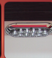
LED Lighting With Manual Override