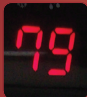
Single Water Tank With Digital Thermostat