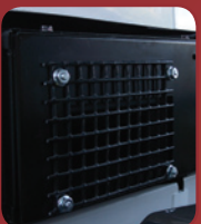
High Output Day Heater